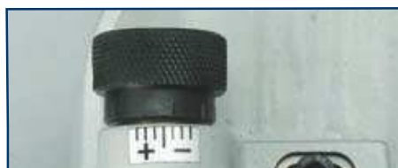
1 Tracer point with micrometric adjustment.