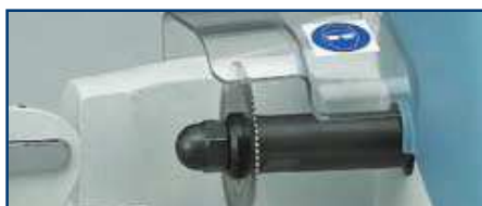
2 Cutter guard.