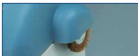
3 Brush incorporated.