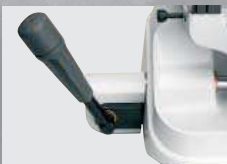
5. Side lever