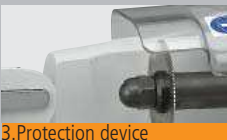
3. Protection device