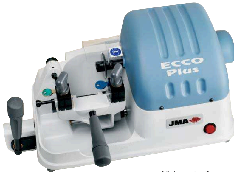
* Photo shows Ecco Plus