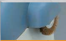
4. Brush incorporated