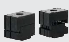
1. 2 way hard steel jaws